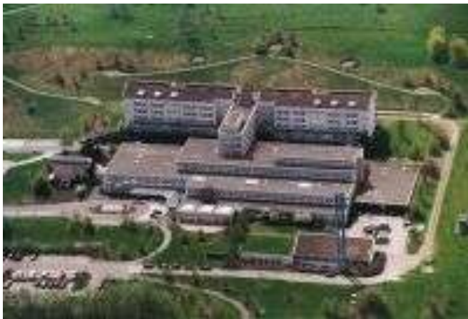
Westfalz Clinic GmbH