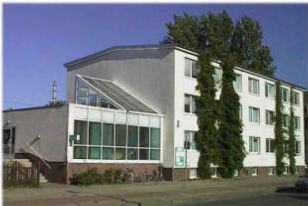
Entrance location Neubrandenburg