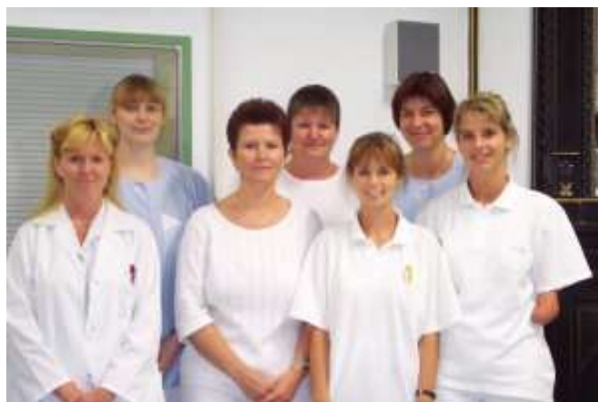
Team of the Radiology