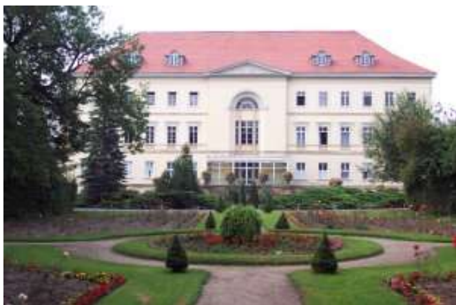
Part of the old Building of the Börde clinic