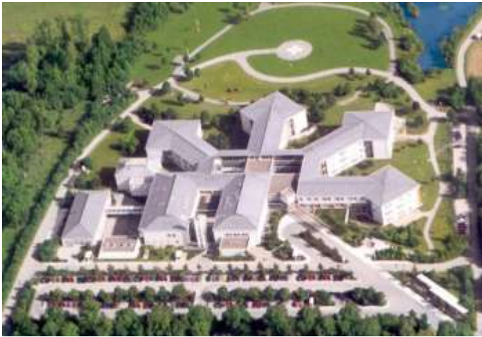
Donau Ries Hospital