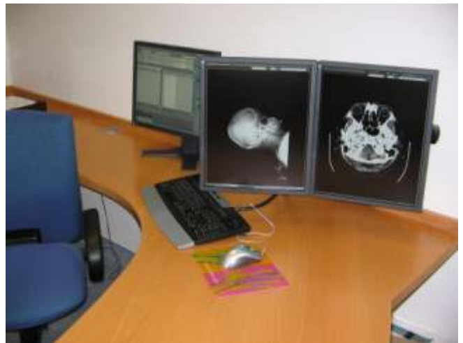
Turn able Diagnostic Workstation