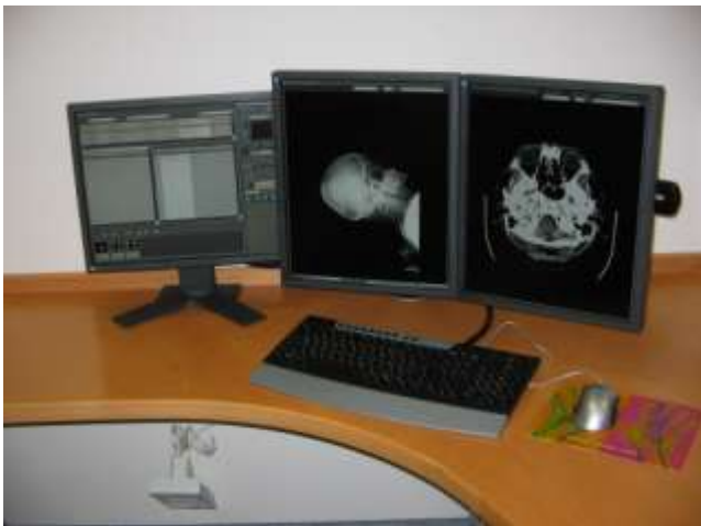
Turn able Diagnostic Workstation