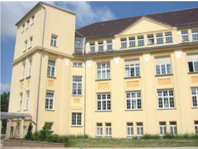
Krankenhaus Burg - Haus A