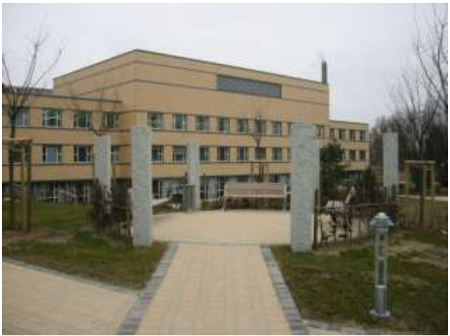
Krankenhaus Burg - Funktionstrakt