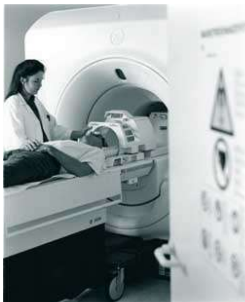
MRT GE Somatom