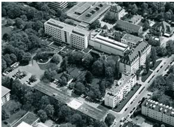
Entrance location Max Planck