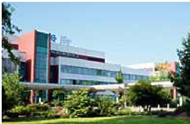
St. Elisabeth-Hospital Gütersloh