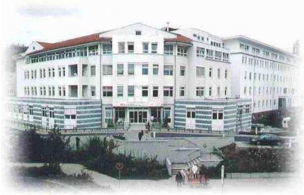
Gesundheitszentrum Wetterau Hochwald Krankenhaus