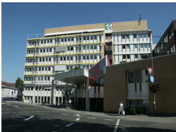
Building Westpfalzlinikum Kaiserslautern