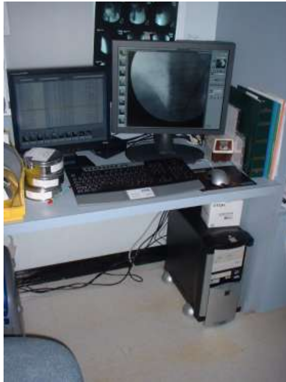
Medimage2 – Dual Monitor Viewing Station