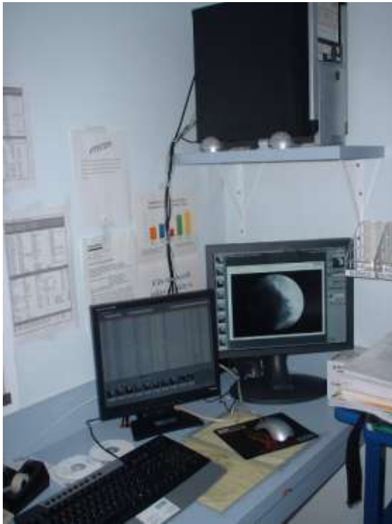
Medimage1 Dual Monitor Viewing Station