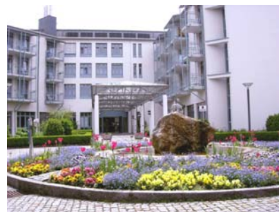
DRV Orthopädie-Zentrum Bad Füssing