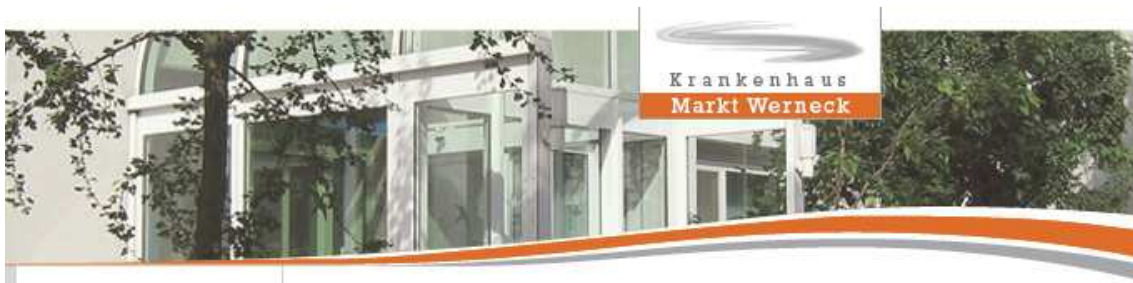
Krankenhaus Markt Werneck