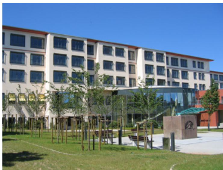
Asklepios Klinik Bad Wildungen